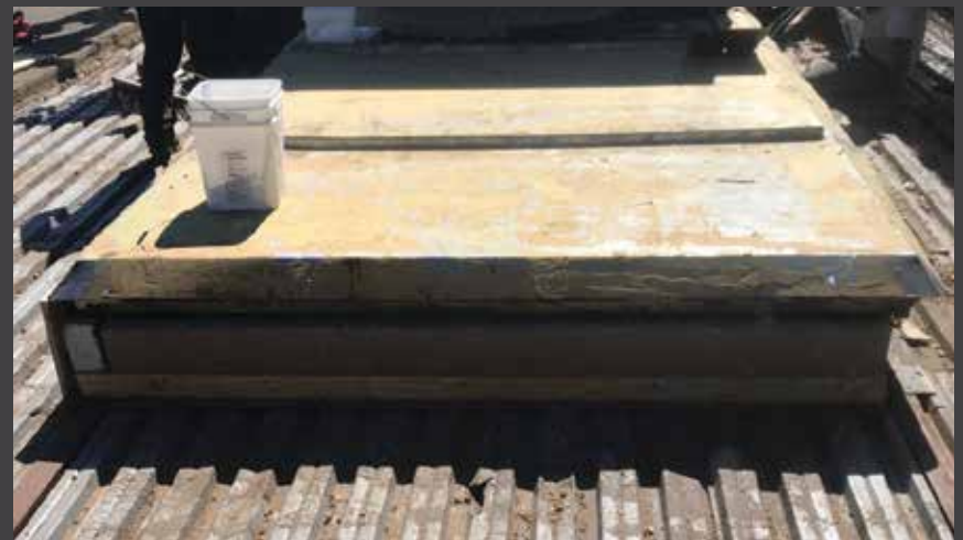
A new roof is being installed at the middle school.