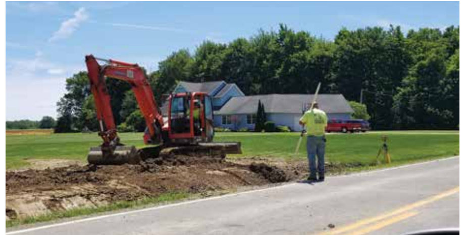
Water line progress on Beeson Street.