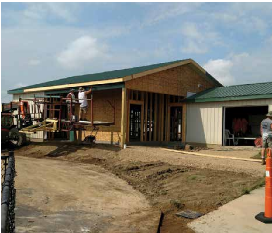
The stadium bathrooms are taking shape.