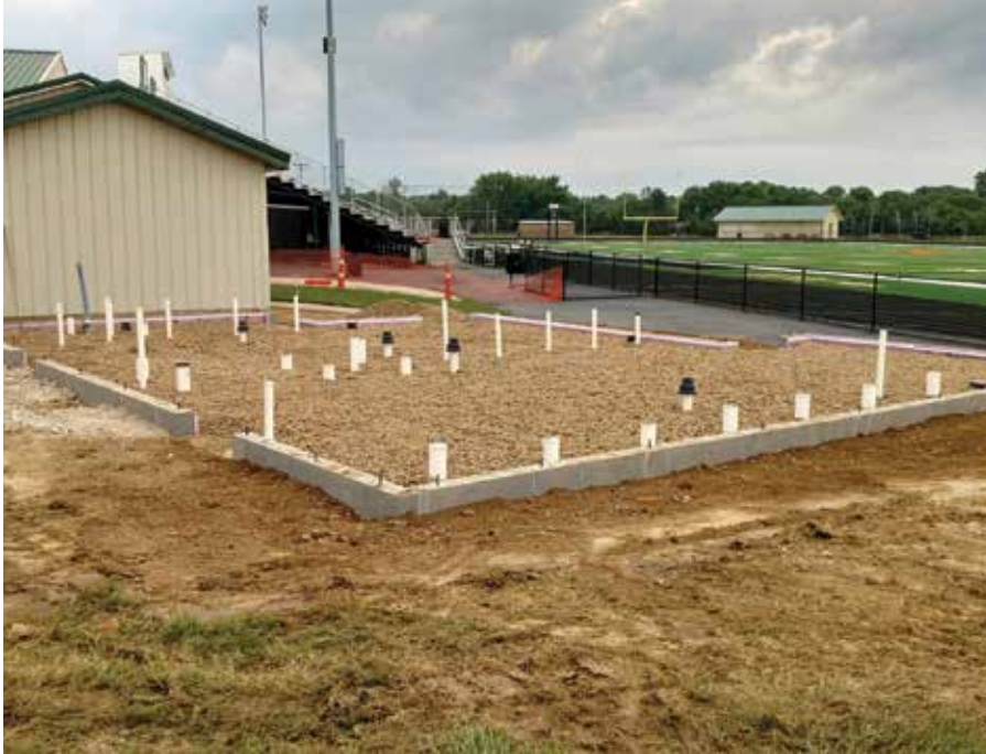
The beginning of stadium bathroom construction.