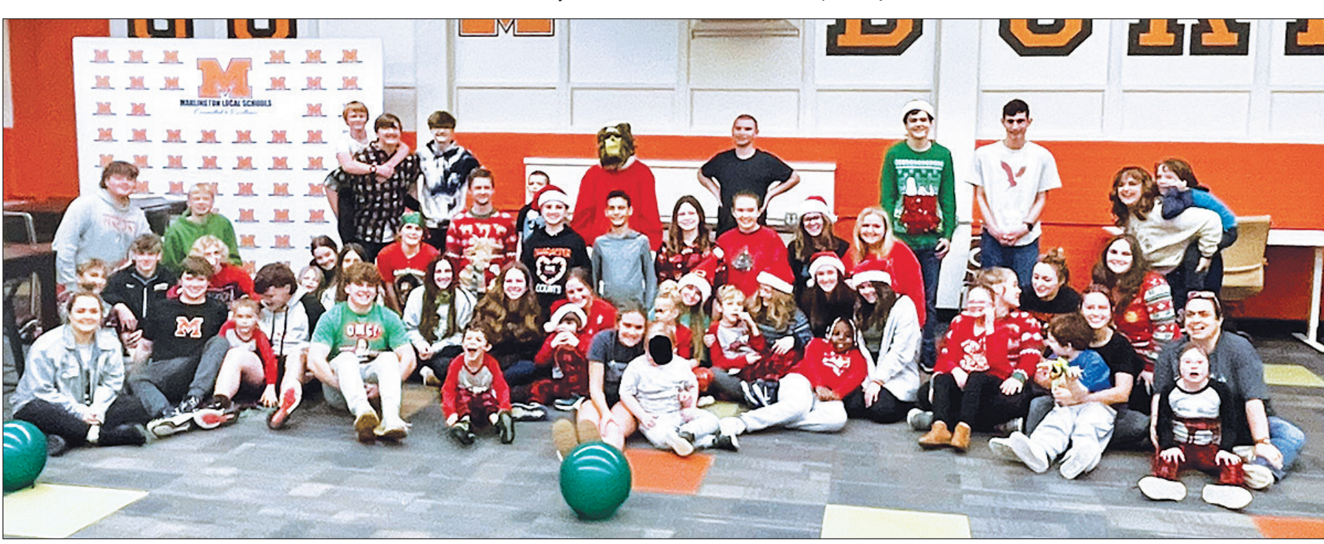
Merry Grinch-mas Party