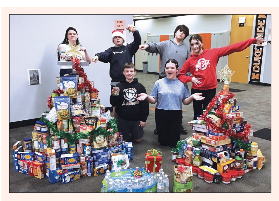
A Message from the Principal