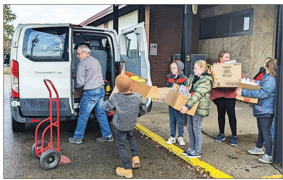
Student council load the gifts that will be donated.