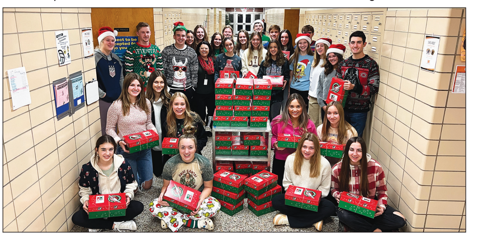
Operation Christmas Child