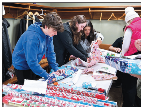
Gifts for Christmas