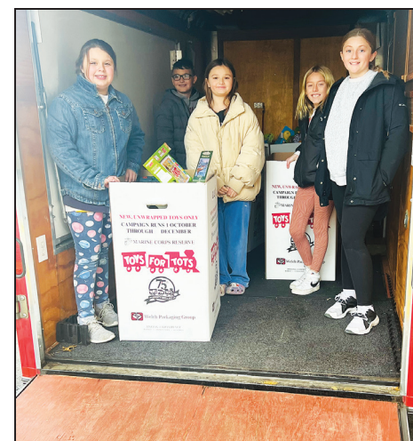
Student council loading up the Toys for Tots gifts.