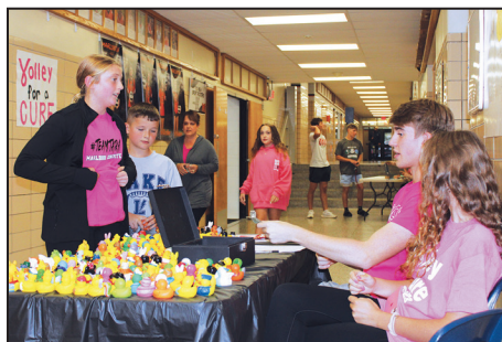
Volley for a Cure