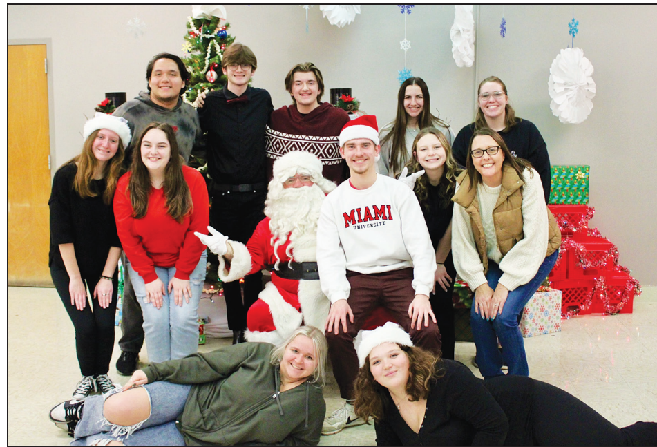
Character Counts Crew with Santa