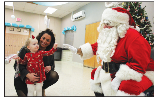
High-Five with Santa