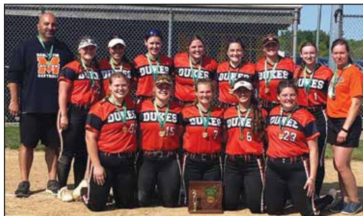
Lady Duke Softball